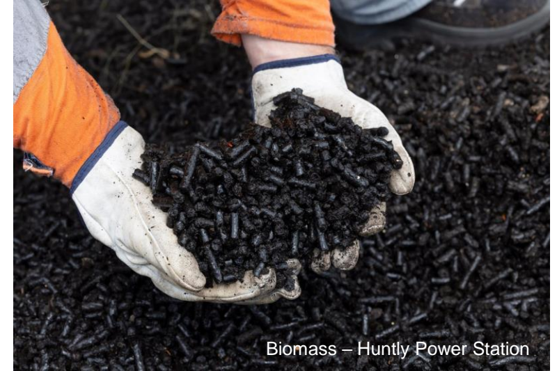
Biomass – Huntly Power Station