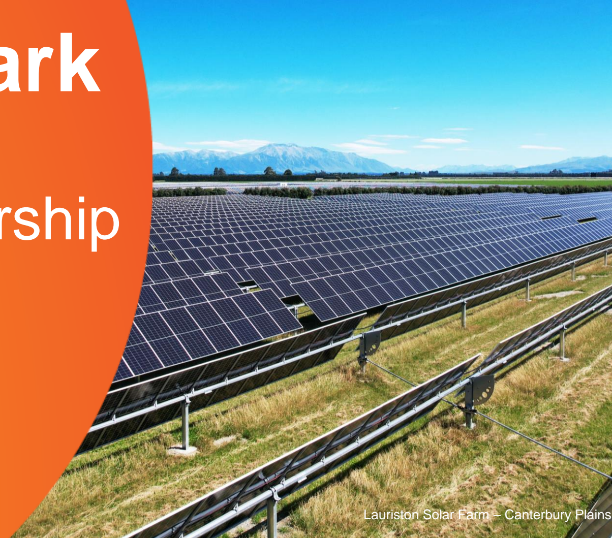
Lauriston Solar Farm – Canterbury Plains