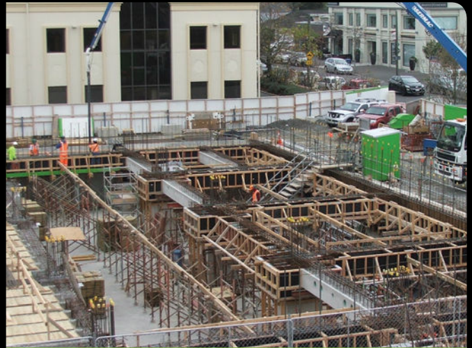
Stage 2 Rebuild foundations

Client: St George's Hospital, Christchurch.