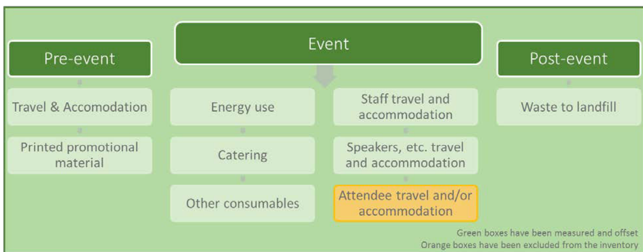
Figure 1: Emissions sources by event stage